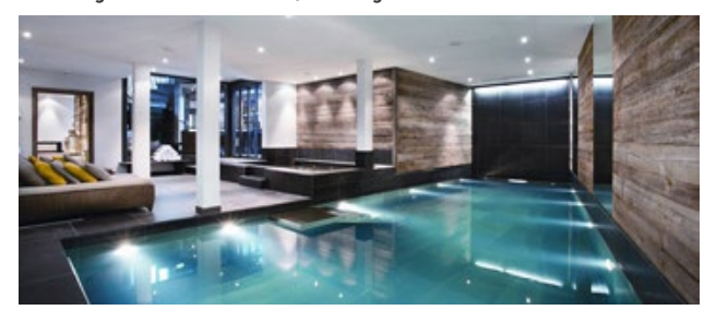
Rates: $$$$$ ededition.com/the-lodge

The Lodge accommodates up to 18 adults in nine rooms as well as six children and teenagers in a specially appointed bunkroom. This luxury chalet has a fully equipped gym, a sauna, a 12-person Jacuzzi and a heated indoor pool. For complete happiness, a friendly team of 13 full-time staff takes care of all the detail.