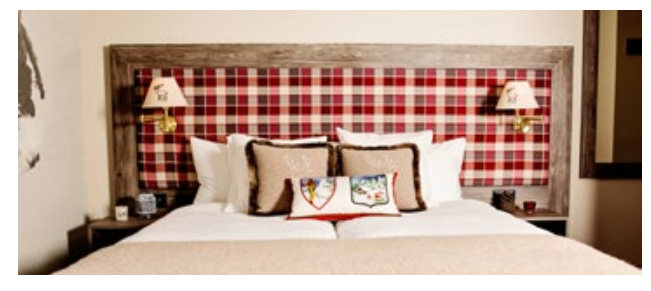
Rates: $$ www.hristol-verhier.ch

A cosy atmosphere, affordable prices, friendly staff and right in the centre of Verbier - this is what Le Bristol offers with 32 carefully decorated rooms in 5 different types to make everyone happy.