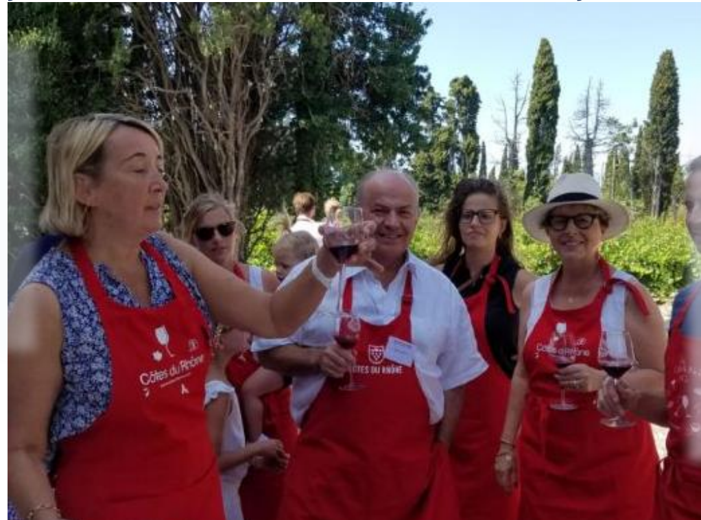
Wine estate in Violes which produces AOP Cotes du Rhone wines

You will make your own blend, your own bottle with its label that you can personalize in memory of this discovery workshop within the domain and in the presence of the winemaker.